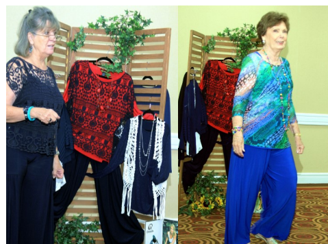
Above - A special session Fashion Show for the ladies.