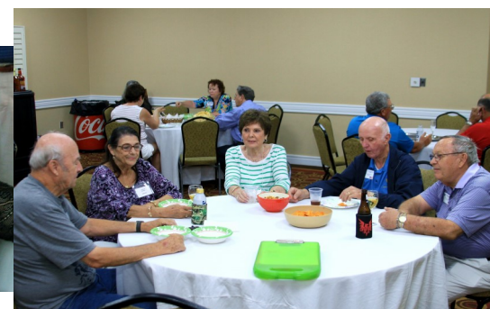
After hours enjoyed at the Hospitality Suite