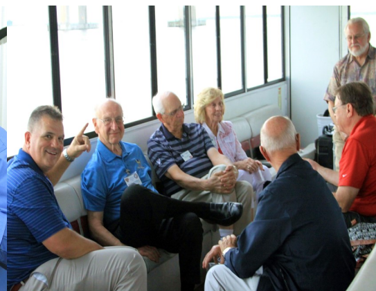
FL Convention members, enjoying the sights Friday evening River Cruise on the St Johns River in Jacksonville. .