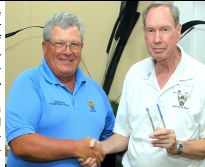
AFA Florida Chapter 399 Member of the Year 2016

These Falcon Team members were identified by their fellow members for their sustained performance in support of the Falcon Chapters activities. It included out reach to the Northeast Area communities and business in promoting AFA Aerospace Education Programs and community partnering. Their interaction with Civil Air Patrol units, the local AFJROTC units, and veteran organizations were also identified in their activities.