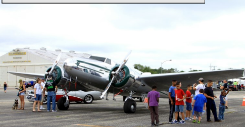
A Classic Aircraft Lockheed Model 18