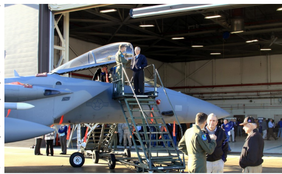
Visitors have an F15E up close cockpit look!

tour culminated at the main hangar housing the aircraft maintenance support equipment. In front of the hangar all visitors watched as select F-15E fighter jets, prepped and run up, then taxiing and take off demos. Wow they sure are loud at take-off!