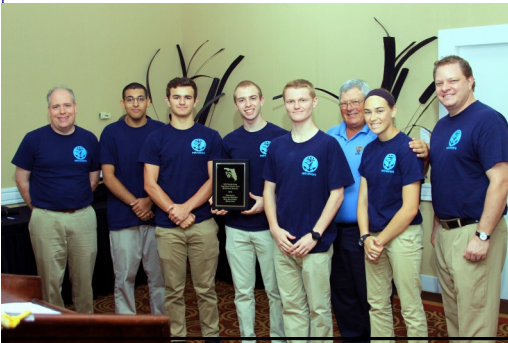
State Award, Top Open Division, 2016 Wizard Squad, Winter Springs HS