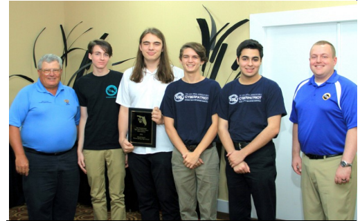
State Award All Service 2016 Centurion Battalion Navy Sea Cadets, Winter Park